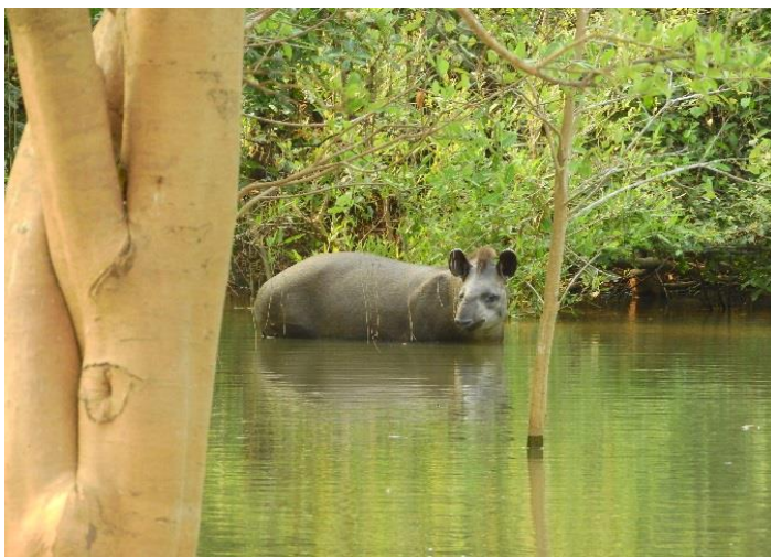
South American Tapir

Commencing in the Southwest at the world famous Pantanal wetland, we go in search of our 'Big Five'. Notoriously shy and elusive, Jaguars are adept at concealment. However, in the Pantanal region of Brazil, Jaguar numbers are higher than anywhere else on the continent and the chance of encountering one greatly increases during the dry period between June and November. This is the season when the Pantanal waters are receding, concentrating both prey and predator into the disappearing wet areas, and it is the time when Jaguars are most easily located. Drawing on experience from our previous Pantanal holidays, and years of running our highly successful 'Just